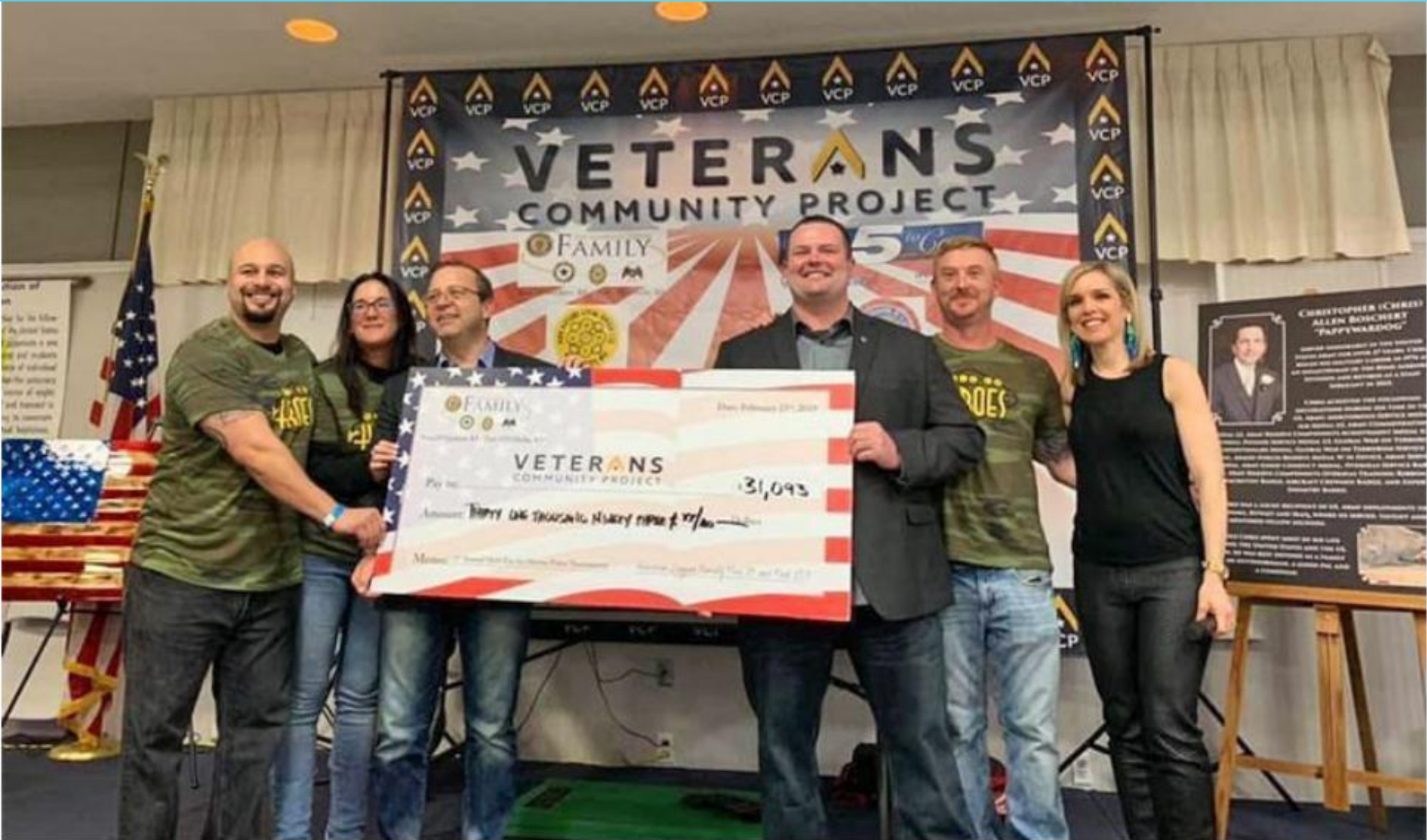
Hold 'Em for Heroes event helps to end veterans homelessness